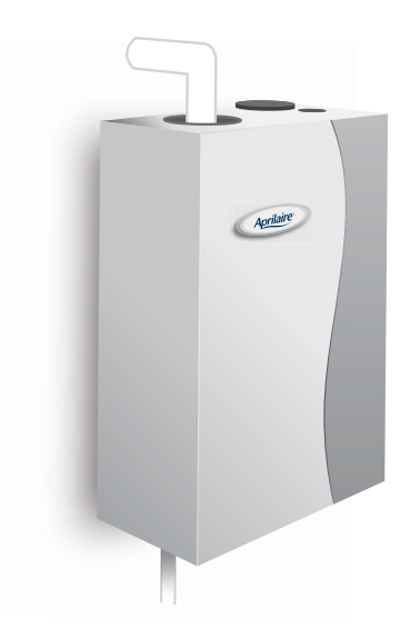
Your dealer will recommend the ideal model and placement for your home.

While dry air can make your home both uncomfortable and unhealthy, there's no need for you and your family to suffer. Aprilaire whole-home steam humidifiers can help. They are installed as part of your home's heating and cooling system and automatically deliver the perfect amount of humidified air, not just to one room, but throughout every room of your home.